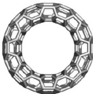
Figure 1. A toroidal fullerene (or achiral polyhex nanotorus) T[p, q] .

A nanostructure is an object of intermediate size between molecular and microscopic structures. It is a product derived through engineering at the molecular scale. In what follows, we aim to apply Corollary 2.5 to the molecular graph of a nanostructure called toroidal fullerenes (or achiral polyhex nanotorus) (see Figure 1 and Figure 2).